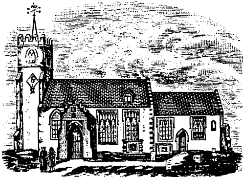
PARISH CHURCH OF PAMPISFORD.

From an ink sketch taken, before it was restored, about 30 years ago.