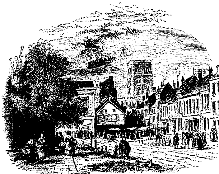
S. ALBANS, HERTFORDSHIRE.